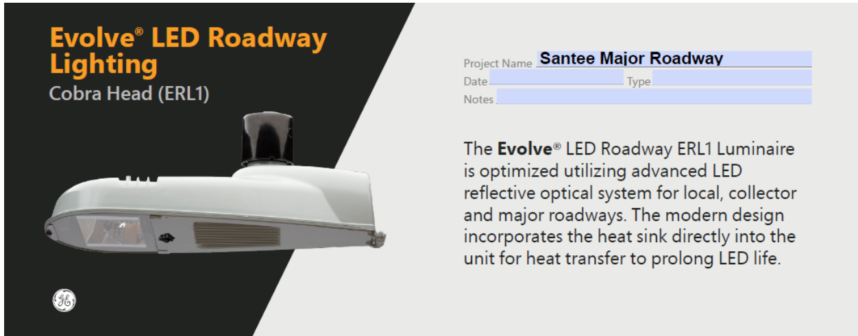
EXHIBIT B – 76 Watt Major Roadway Luminaire GE ERL1-0-10-B5-40-7-GRAY-L